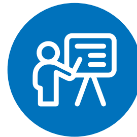
Annual Security Awareness Training