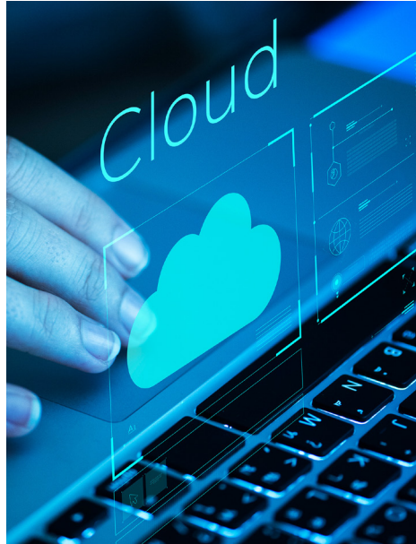
Digital Forensics and Incident Response