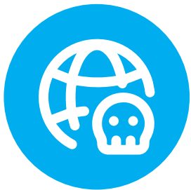
Continuous Dark Web Monitoring