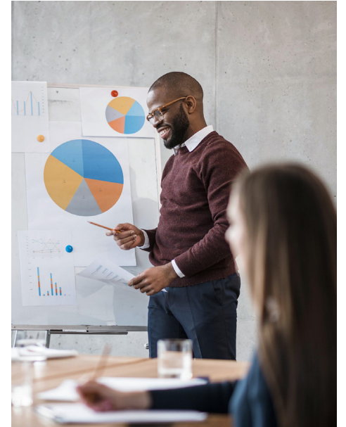
ISO Certification Training and Examination