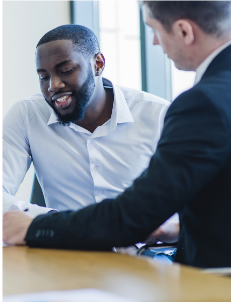
Security and Compliance Advisory