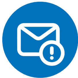
Phish Email Analysis Tool